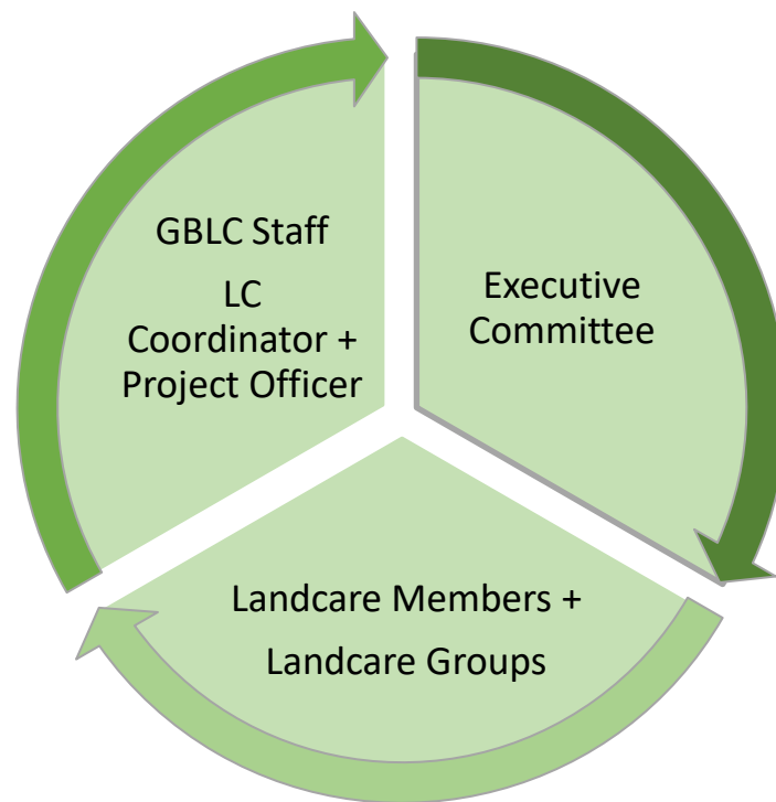
Figure 2. GBLC Organisation

GBLC is a not-for-profit organisation that formed in 1994 to support a network of Landcare groups and communities with shared community and environmental interests in the Granite Border regions of the Tenterfield (northern NSW) and Stanthorpe (southern Qld) shires. We are one of four Landcare Networks in the New England Landcare Network (NELN) region, working together to deliver state, regional and local projects towards positive outcomes for communities involved in natural resource management.