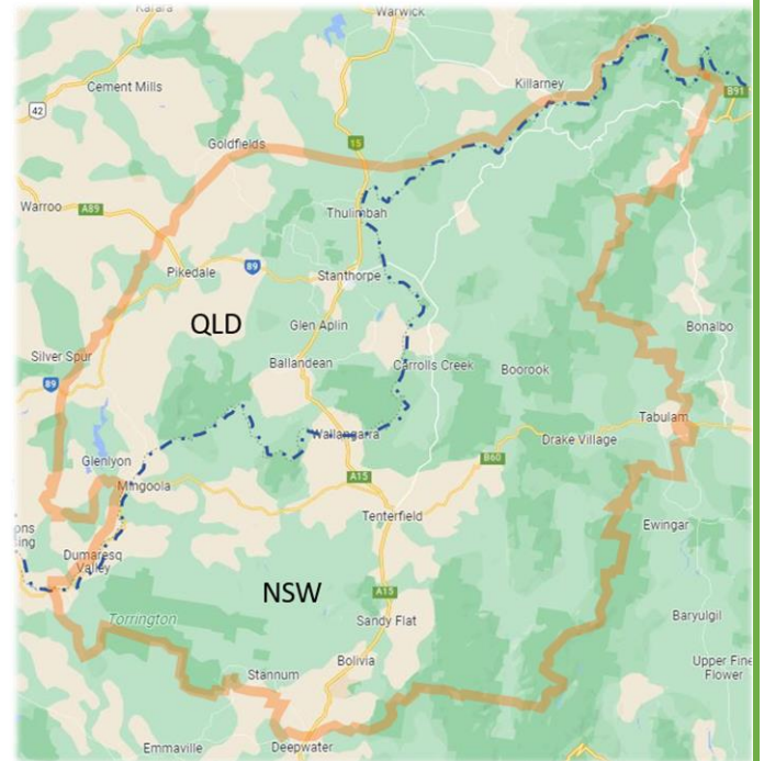
Figure 1. Granite Borders Landcare Committee Inc. Area

Serving both the Tenterfield and Stanthorpe shires, Granite Borders Landcare Committee is unique in its cross-border Landcare Commitment. Our members have a diversity of backgrounds, interests, skills and attributes, arising from our varied ecological landscapes. This and approaches to cross-border natural resource management. Historically, the Granite Belt border region has gone through numerous agricultural iterations, including sheep, cattle, grain, tobacco and orchards. There is a growing number of smaller lifestyle landholders, which has changed the community and land use profiles since our beginnings in the 1990s.