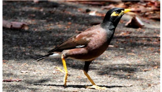
Common myna (above,), Noisy miner (below left,) and Yellow-throated miner (below right,)

Impacts: Mynas were listed among 100 of the world's worst invasive species by the World Conservation Union (IUCN) in 2000. In Australia, common mynas are considered to threaten native biodiversity due to their territorial behaviours and nest cavity competition. They are lifelong monogamous and sedentary 3 – breeding